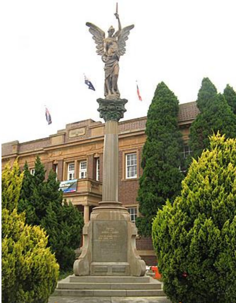
Marrickville Soldiers' Memorial